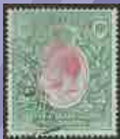
Lot 1612 Est £100