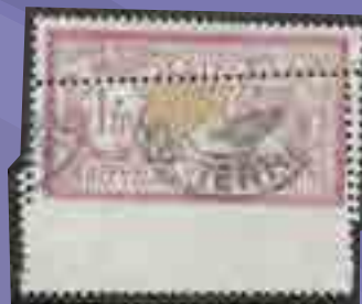
Lot 860 Est £36