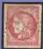
Lot 852 Est £500