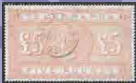
Lot 2345 Est £900