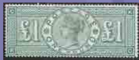
Lot 2584 Est £900