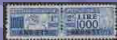
Lot ex 2231 Est £250