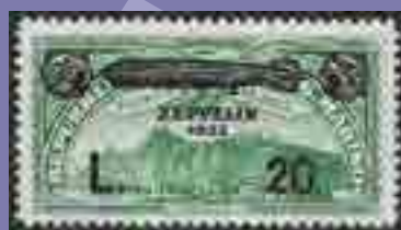
Lot ex 2062 Est £65