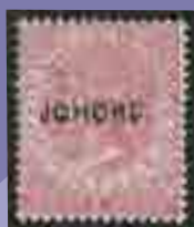
Lot 1685 Est £110