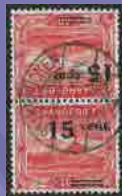
Lot 1278 Est £110