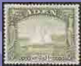
Lot ex 277 Est £600

Tel: 07938 601513 Email: info@avhstampauctions.co.uk