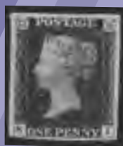
Lot 2362 Est £1,200